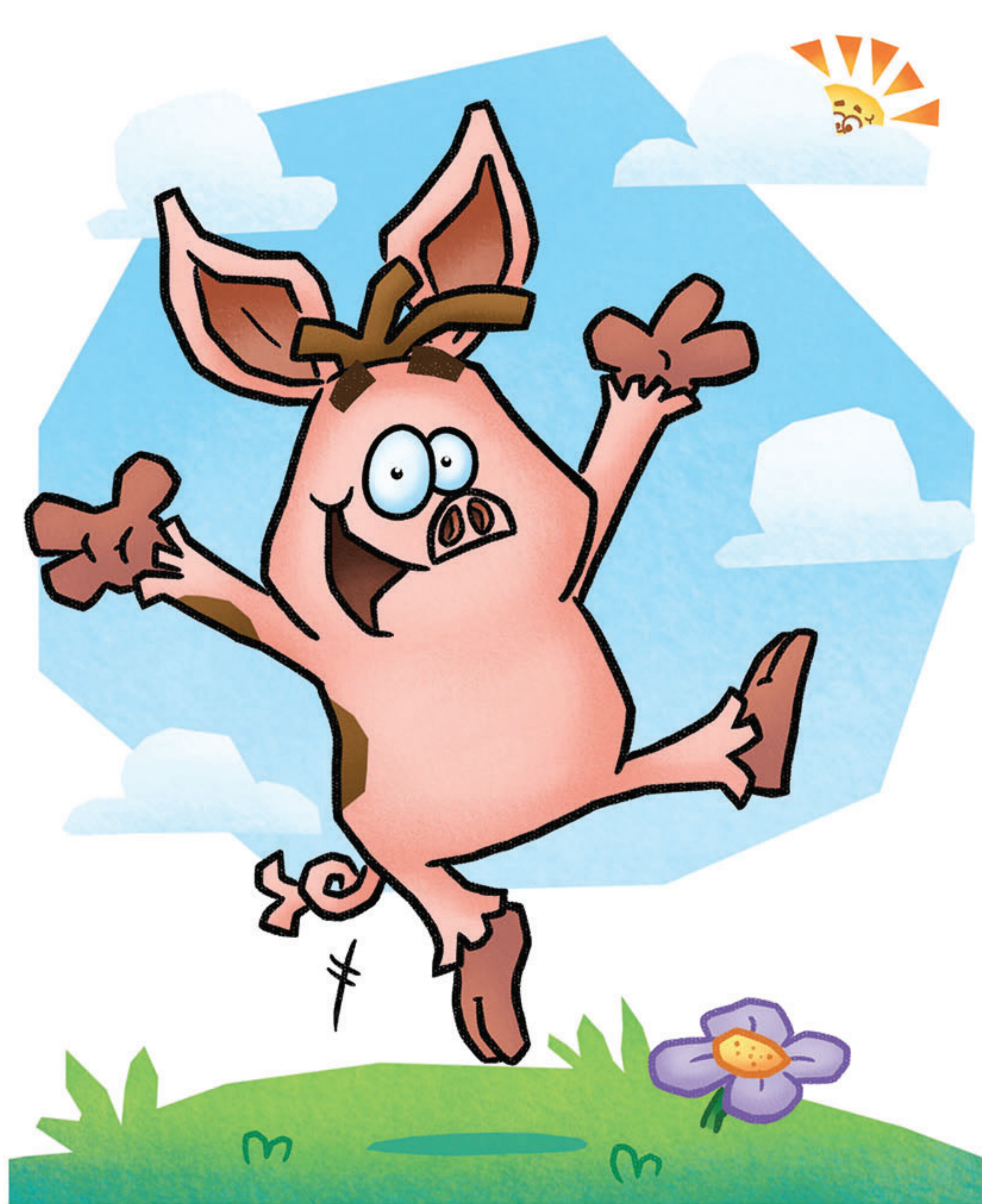
Tim is a pig.